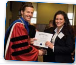
2011 Outstanding Beta Gamma Sigma Chapters Clockwise from top left: La Salle University, Gold Chapter; Saint Joseph's University, Silver Chapter; Stephen F. Austin State University, Bronze Chapter; Coastal Carolina University, Honorable Mention