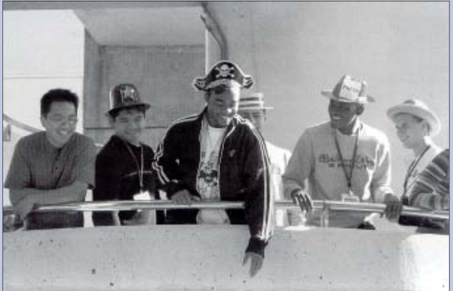
The 2003-04 Student Leadership Forum was held Oct. 30 - Nov. 2, 2003, in Baltimore, Md. This year, 86 students from collegiate chapters across the United States took part in the Forum, which is designed to help students make decisions about their futures - both personal and professional. Look for the complete story of this year's Forum in an upcoming BGS International Exchange .