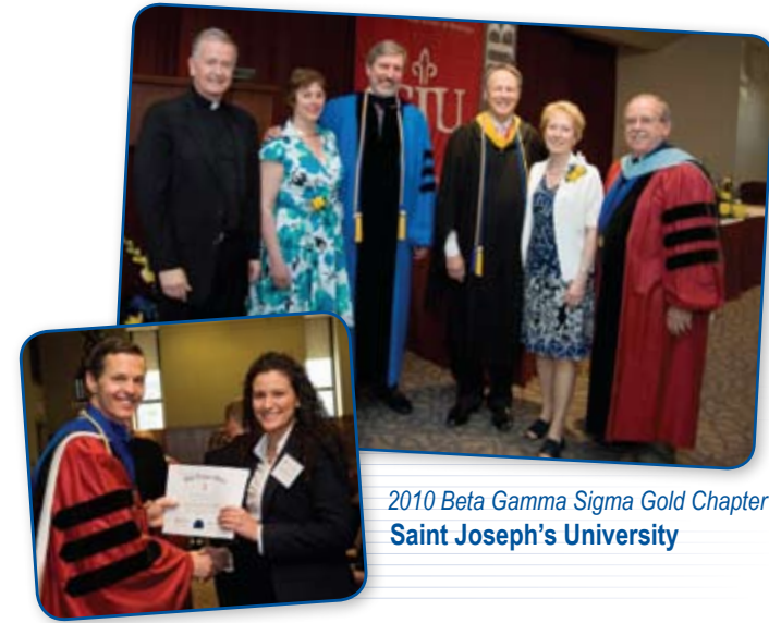
2010 Beta Gamma Sigma Gold Chapter Saint Joseph's University